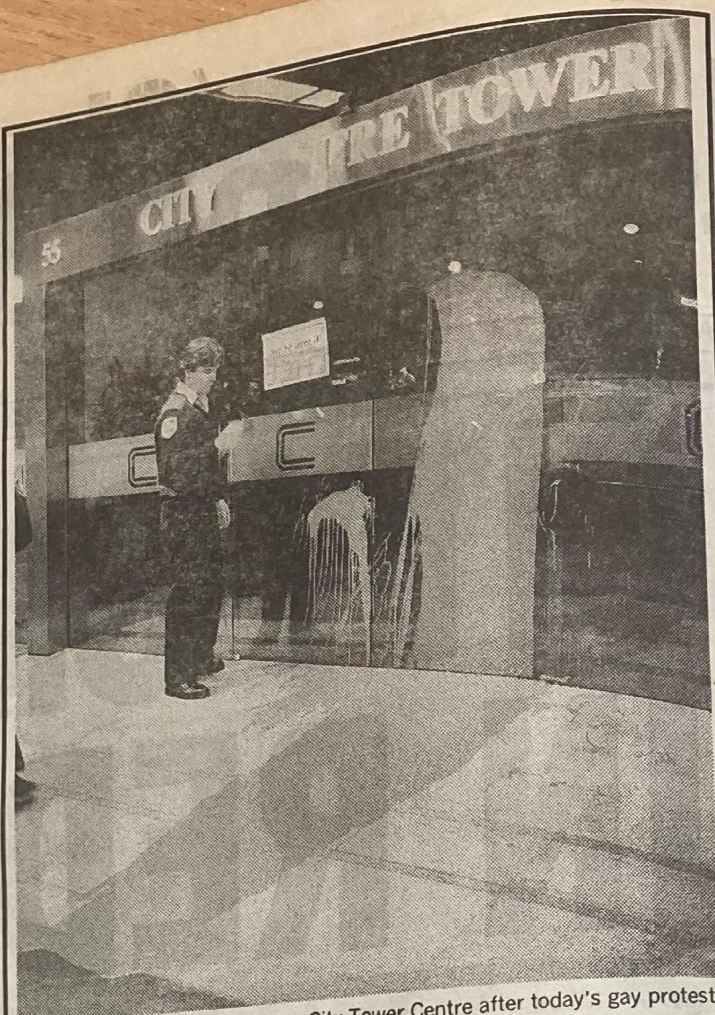
The paint-daubed entrance to the City Tower Centre after today's gay protest

The flat was severely damaged but no one was injured.