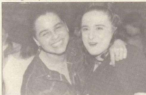
At The Other Side after the launch

The Off Our Backs Report was also launched by Police Minister Ted Pickering, on September 21.