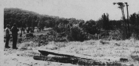
The cleared area at the course.