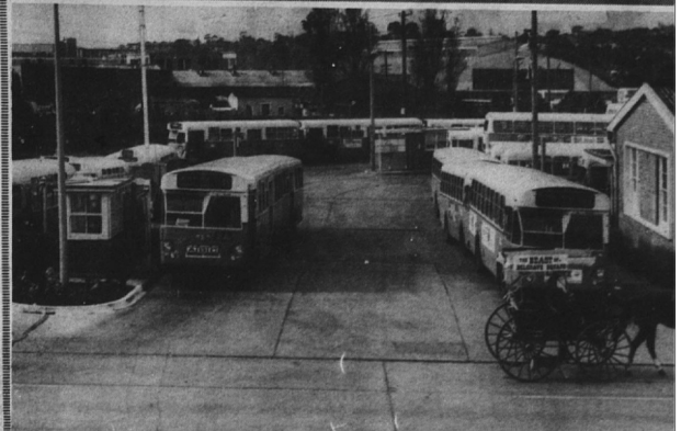
MANLY-WARRINGAH was hard hit by yesterday's bus crew stoppage. Instead of the four-hour stop work announced, buses were off the road for almost seven hours due to the distance crews had to travel to attend the meeting. Travellers ran out of bus transport shortly after 8.30 am and were unable to obtain carriage had no worrie one horse power.