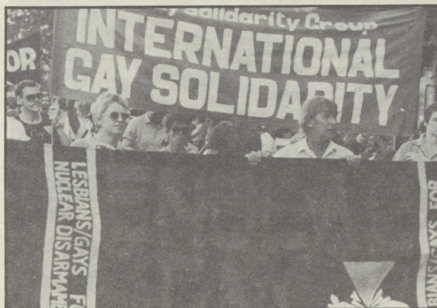
A strong contingent of gay men and lesbian members of Enola Gay, working in the interests of nuclear disarmament, took part in the May Day parade through the streets of Sydney. The group is highly visible on the local scene and has also taken part in numerous Palm Sunday Rallies.