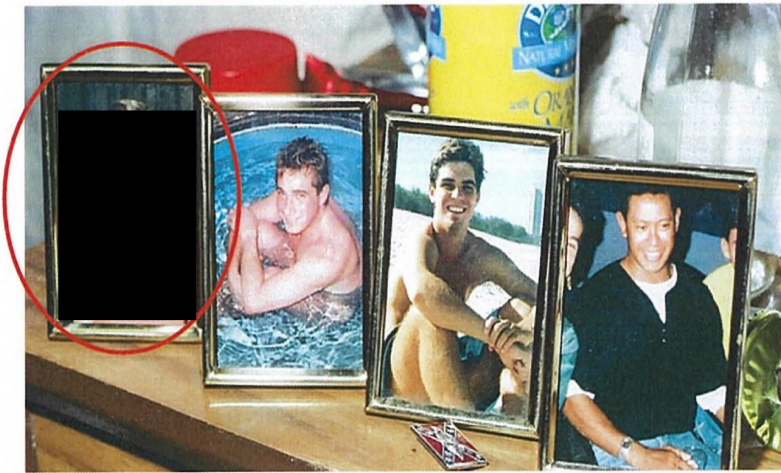
Circled male is identified by [198] as being [1413]

The below photograph was shown to [198] who was only able to identify the male in the far left as being [1413]