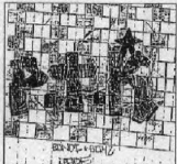
Part Time Killers graffiti.

He said the two youths yelled: "You're a poofster and you don't deserve to live."