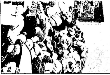
dy pile.